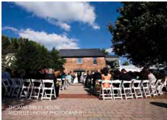
THOMAS BIRKBY HOUSE