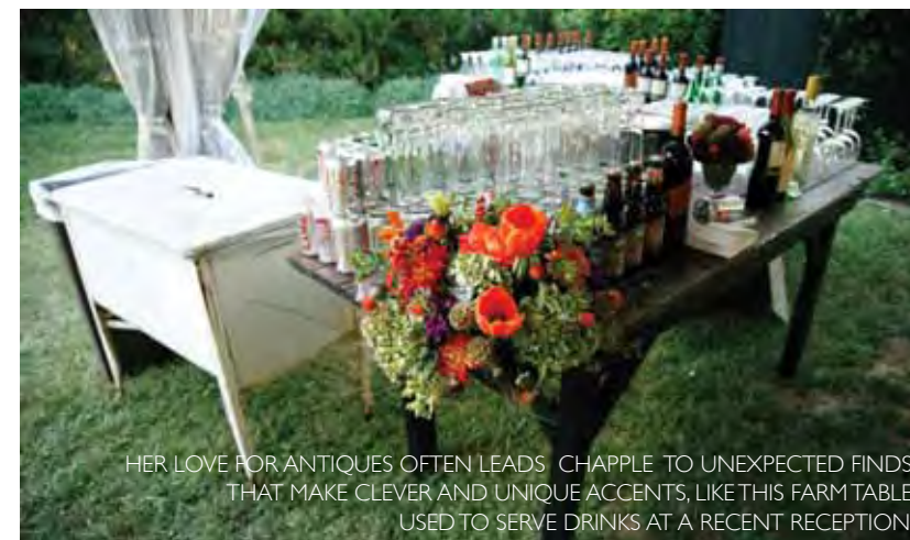
HER LOVE FOR ANTIQUES OFTEN LEADS CHAPPLE TO UNEXPECTED FINDS THAT MAKE CLEVER AND UNIQUE ACCENTS, LIKE THIS FARM TABLE USED TO SERVE DRINKS AT A RECENT RECEPTION.