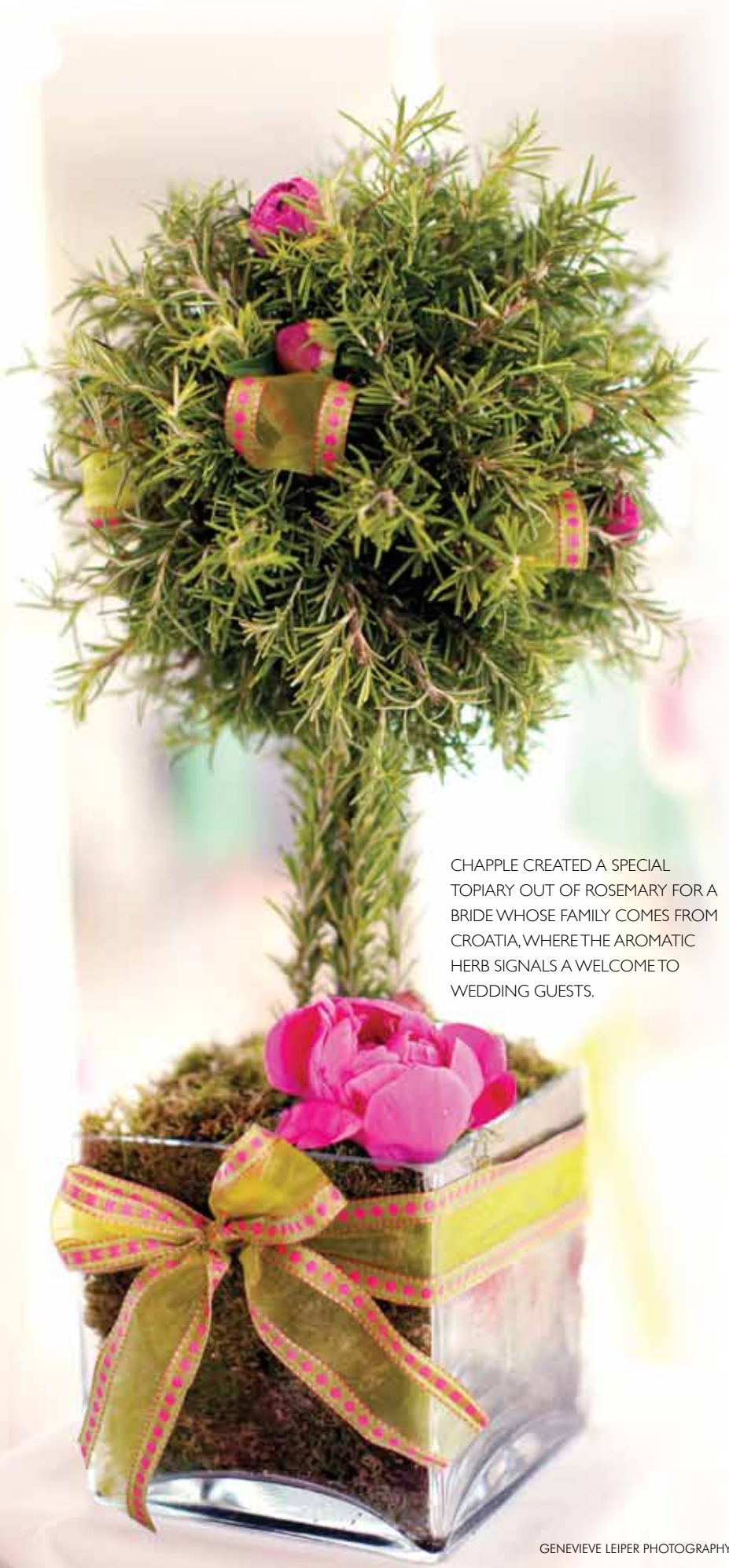
CHAPPLE CREATED A SPECIAL TOPIARY OUT OF ROSEMARY FOR A BRIDE WHOSE FAMILY COMES FROM CROATIA, WHERE THE AROMATIC HERB SIGNALS A WELCOME TO WEDDING GUESTS.